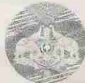
Director of Technical Education