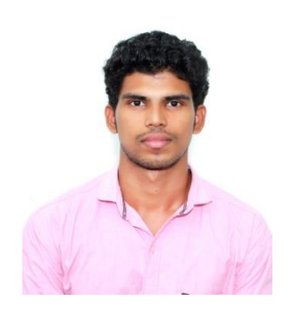
WORK EXPERIENCE 1 Month Internship